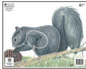
NFA-26 – Squirrel