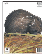
NFA-28 – Muskrat