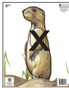
NFA-27 – Prairie Dog