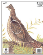
NFA-23 – Grouse