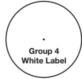
Group 4 White Label