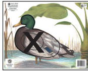
NFA-22 – Duck