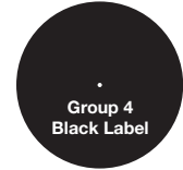
Group 4 Black Label

Spot Locator Templates are available to help position Bonus Point Labels (Spots).