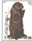
NFA-24 – Woodchuck