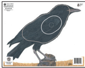
NFA-25 – Crow